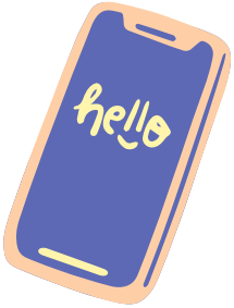
photo phone phases